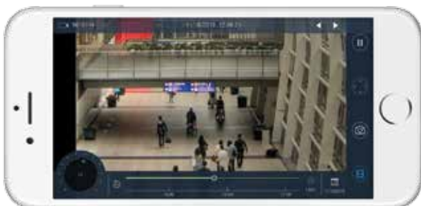
DVM Mobile Dashboard